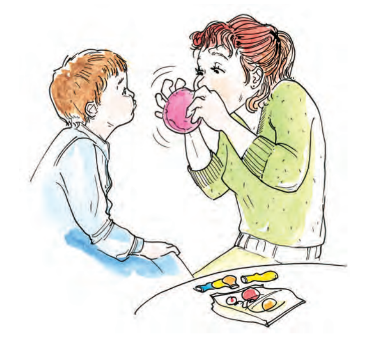
This little boy asks his mother to make the balloon bigger by showing her how to blow it up.

Blow up a balloon, and then let the air out. (Your child may like it if you let the balloon fly in the air.) Then put the balloon to your mouth and wait for your child to ask you, in some way, to blow it up again. Or, blow up a balloon partially. Then, with the balloon at your mouth, wait for your child to ask you in some way to blow it up more.